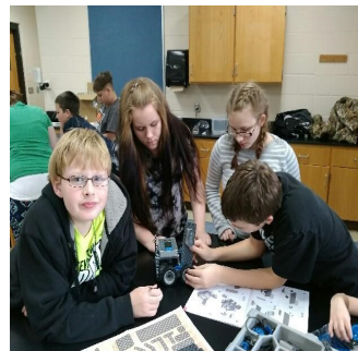
The 4-H After-School Robotics Club in Iosco County received a $1,000 Michigan 4-H Legacy Grant to use VEX Robotics as a tool

Learn more or apply online at http://mi4hfdtn.org/grants . Questions? Contact the Michigan 4-H Foundation at 517-353-6692.